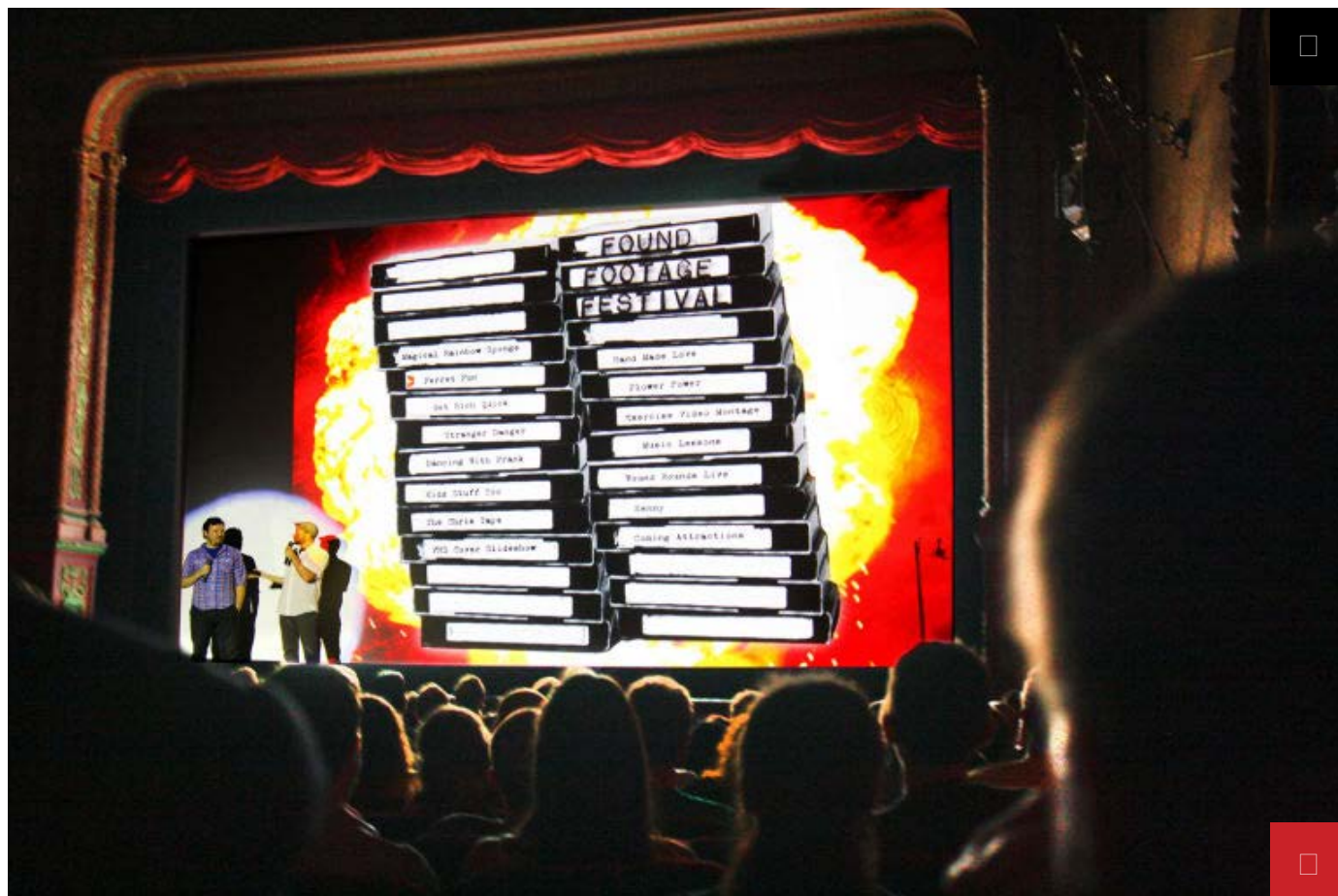
Found Footage Festival

want a message. Something that's quick and punchy. So you just write these press releases to tick all the boxes.